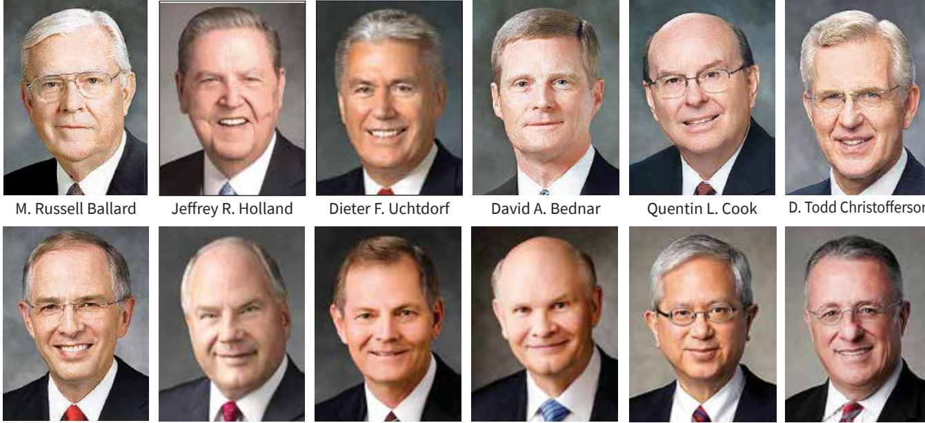
M. Russell Ballard Jeffrey R. Holland Dieter F. Uchtdorf David A. Bednar Quentin L. Cook D. Todd Christofferson Neil L. Andersen Ronald A. Rasband Gary E. Stevenson Dale G. Renlund Gerrit W. Gong Ulisses Soares